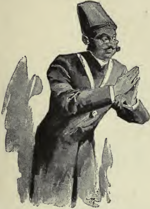
MR. BUX JOINED HIS HANDS TOGETHER.

as if to supplicate me not to blame him in the matter, and even in that moment of extreme irritation I observed the grace of the Oriental gesture. After my nephew's conduct, it